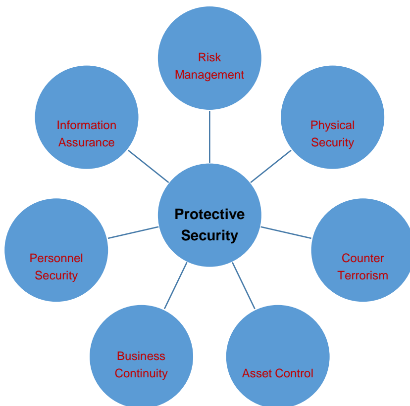
Figure 1 - The elements of Protective Security